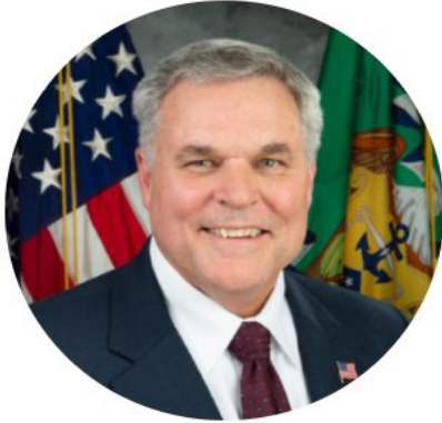
Commissioner Charles P. Rettig

Charles P. Rettig is the 49th Commissioner of the IRS. In leading the IRS, Mr. Rettig is focused on improving service to the nation's taxpayers, balancing appropriate enforcement of the nation's tax laws while respecting taxpayer rights.